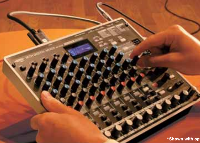
*Shown with optional long cable DXC-7 (7 m/23 ft.)