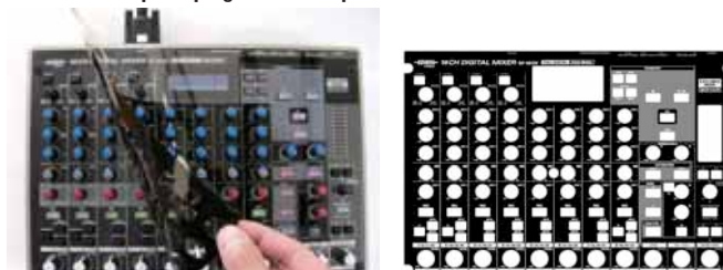
Template Sheets are included.