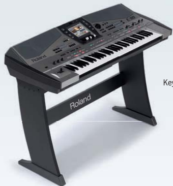
Keyboard stand KS-E-80 (optional).