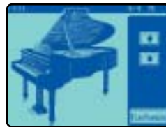
Piano Lit (open/close)