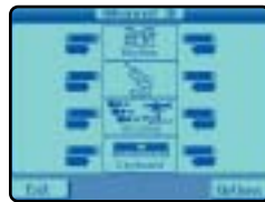
Advanced 3D Effect

Versatile in every way, the KF-90 also features a variety of digital effects to give you just the right quality of tone desired. An advanced three-dimensional surround sound effect lets you simulate the excitement of a live on-stage performance. Using this effect you can, for example, place the instrument you are playing at "center stage" while ensemble sounds are spread naturally to the left and right.