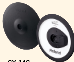
CY-14C V-Cymbal Crash