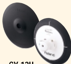
CY-12H V-Cymbal Hi-Hat