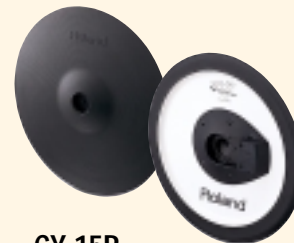
CY-15R V-Cymbal Ride