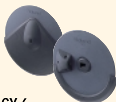
CY-6 Dual-Trigger Cymbal Pad